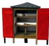
Fire Hose Shed

I'll also have more of the Glue Loopers - demand has been hot! And some of the glue pens we saw in the January clinic. More finger LED lights, Golden Spike stamps, HO gages etc. for sale at upcoming meetings.